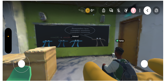
Fig. 4. Polycam classroom creation: A demo showcasing a classroom environment created with Polycam, an iOS application that utilizes iPhone LiDAR sensors, allows users to interact with the environment, communicate via text or audio, or watch an educational video through Spatial.io services.(click the link to access the metaverse using Mobile,VR,or the Web).

c) Metaverse exploration: Unity can be leveraged to reimagine a room scanned with LiDAR by importing the low poly 3D models generated from PolyCam into the Unity game engine. Once imported, it is possible to populate the virtual room with furniture and other objects to create an interactive and realistic environment. Through integration with Spatial.io, users can interact within the populated room, utilizing features such as voice and text chat to communicate and provide real-time feedback. This collaborative approach allows users to experience and modify the virtual environment, enhancing the design process and ensuring that the final result meets their needs and expectations. Moreover, it is possible to enable object placement through edge devices on multiple platforms, such as VR and mobile. This capability requires a set database of 3D objects and custom components that facilitate object placements. By combining Unity’s powerful rendering capabilities with Spatial.io’s interactive features, and leveraging edge devices for seamless object manipulation, developers can create immersive and engaging virtual spaces within the metaverse. This facilitates meaningful user interactions and feedback, advancing the possibilities for virtual staging and collaboration in the evolving metaverse landscape.(See Fig. 4)