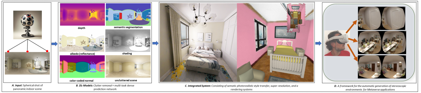
Fig. 1. AI-Image-Based Pipeline: Several AI models are integrated and synergized to process and generate the virtual staging environment. The framework is composed of four integral modules: (A) Input Module: A single RGB panoramic image of an indoor environment taken using a 360° camera. (B) Deep Learning Models: This component comprises a network designed for the extraction of various signals. Our comprehensive approach autonomously procures essential signals such as depth, semantics, shading, reflectance, color-coded normals, and empty scene representation, thereby synergizing the generation of virtual staging applications for the metaverse. (C) Example of virtual staging process leveraging the AI-Based Image Processing Pipeline: [42] is used for semantic style transfer, a super-resolution model [4] is used to increase details, a rendering system [41] is used for interactive exploration, object insertion, and editing etc. (D) A framework for the automatic generation and exploration of immersive scenes representing indoor stereoscopic environments, which can be navigated using VR setups on lightweight WebXR viewers, making it ideal for Metaverse applications [30].

image [34]. The framework is able to concurrently extract diverse types of information—such as depth, normals, semantic segmentation, reflectance, and shading—from indoor panoramic images (See Fig. 2 [B] for examples). This is achieved through a transformer-based encoder-decoder architecture that leverages multiple heads for dense estimation. By incorporating a context adjustment layer, the framework ensures effective knowledge distillation between the encoder and various decoder heads, enhancing the quality of predictions for each signal.